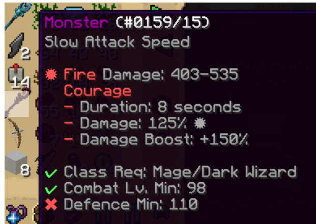
Figure 2: Monster after applying 3 tier 6 fire powders.

[363-472] + [40-53] = [403-535] fire damage as expected! Woohoo!