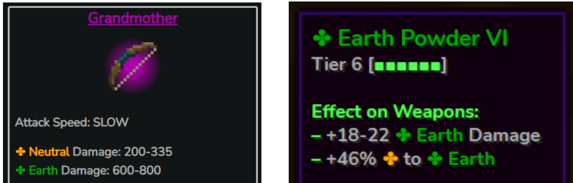
Figure 5: Left: Unpowdered Grandmother. Right: Earth powder 6.

The relevant weapon and powder information is shown below.