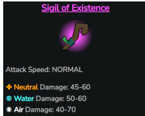
Figure 3: Sigil of Existence. (IDs not shown)

Consider the following build as an example: (clickme)