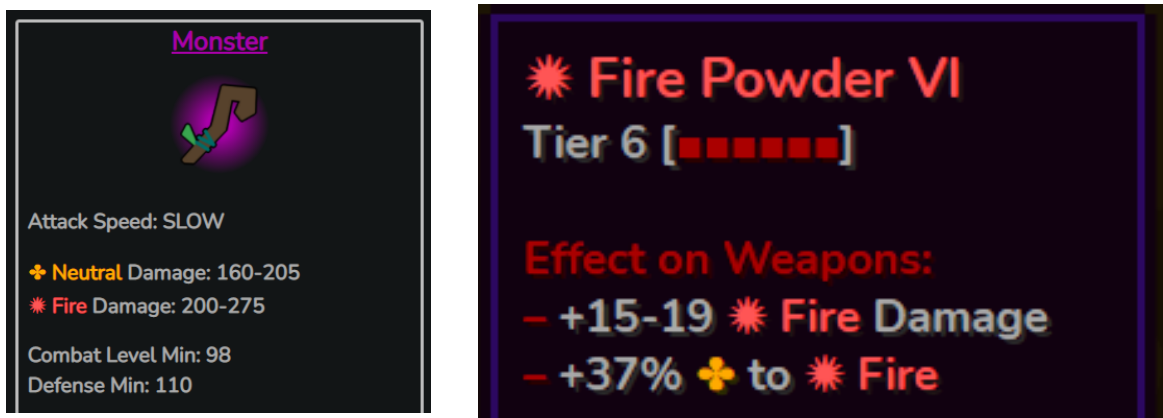
Figure 1: Left: Unpowered Monster. Right: Fire powder 6.

Monster has a base of [160-205] Neutral Damage and [200-275] Fire Damage.