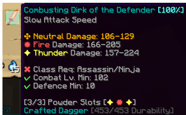
Figure 7: Powdered Combusting Dirk of the Defender